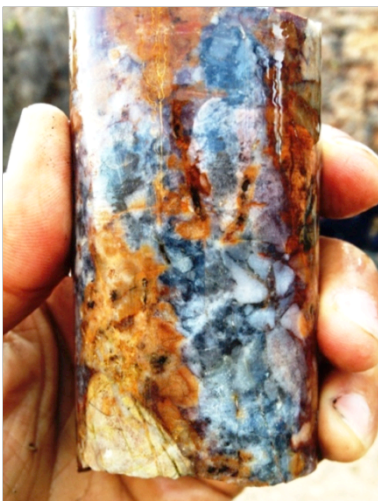
Silver Eagle Target Drill Core Sample

LEADERSHIP. MOVING FORWARD. BUILDING VALUE.